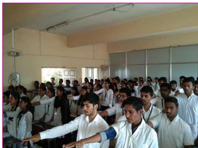
Voter's Day Pledge