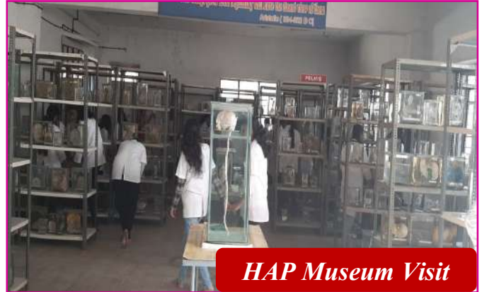
HAP Museum Visit

Hospital Visit was organized to Dr. J. J. Magdum Trust Hospital, Jaysingpur on 22 th January 2020.