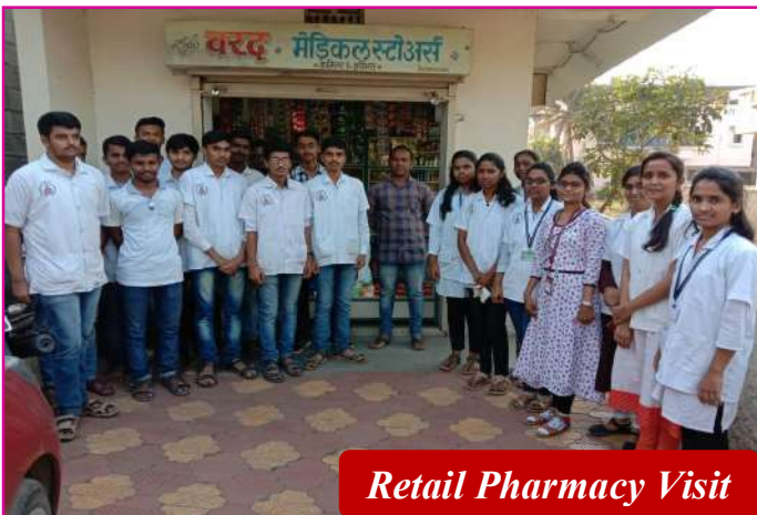
Retail Pharmacy Visit

HAP visit was organized to Dr. J. J. Magdum Homeopathic Medical College, Jaysingpur on 24 th January 2020.