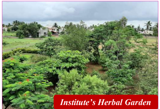
Institute's Herbal Garden

Retail Pharmacy Visit was organized to Varad Medical Store, Jaysingpur on 14 th February 2020.