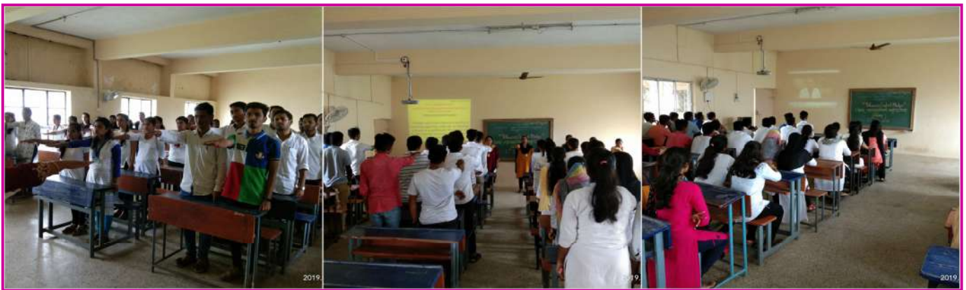
Tobacco Control Pledge on 11 th July 2019

Following is the pledge taken by students of DCP-II, faculty and staff members. “I Pledge not to use tobacco in any form including cigarettes, bidis etc. or chewing tobacco or as gutkha etc. for the rest of my life and also encourage my family and friends not to do so.”