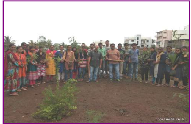
Celebration of Van- Mahostav Day on 01 st July 2019